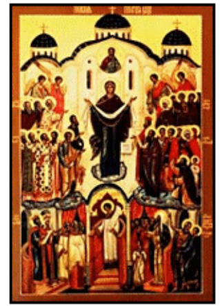
Protection of the Virgin Mary

8600 Grand Blvd. Merrillville, IN 46410 (219) 947-4748 (Church) (219) 730-4698 (Hall Rental)